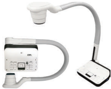
Full HD Document Camera