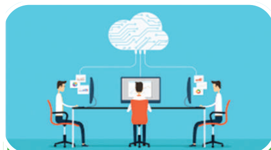
Learning Management System