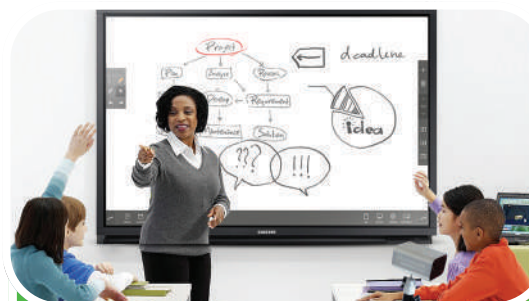
Portable Interactive Whiteboard